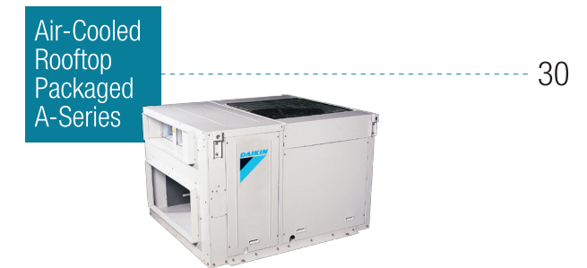
Air-Cooled Rooftop Packaged A-Series