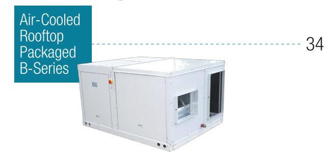
Air-Cooled Rooftop Packaged B-Series