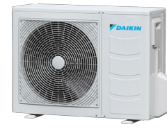
RYN50/60CXV1 RYN50/60CXY1 RQ71CXV1 RQ71CXY1