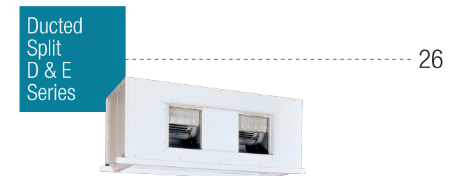
Ducted Split D & E Series